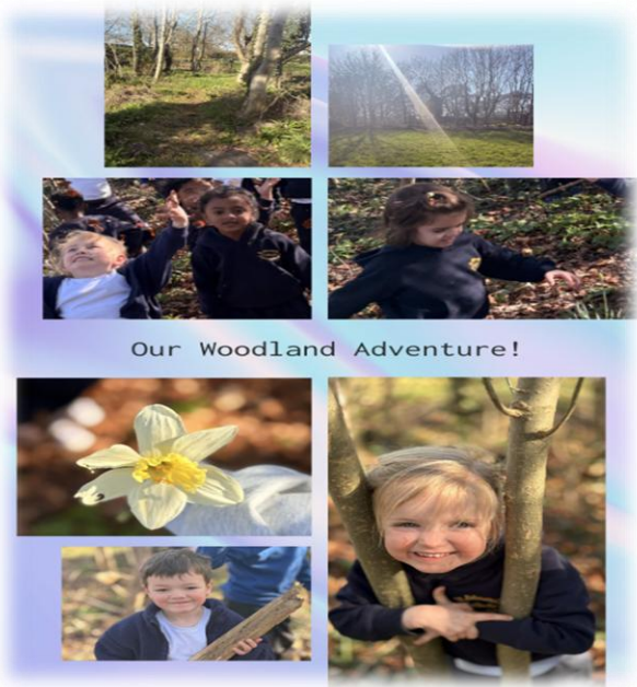
Our Woodland Adventure!

In EYFS we enjoyed our little trip to the woods to help us enhance our English learning all about how to write a recount - we are using the images from the trip to help us remember what we saw, heard and found!